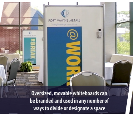
Oversized, movable whiteboards can be branded and used in any number of ways to divide or designate a space