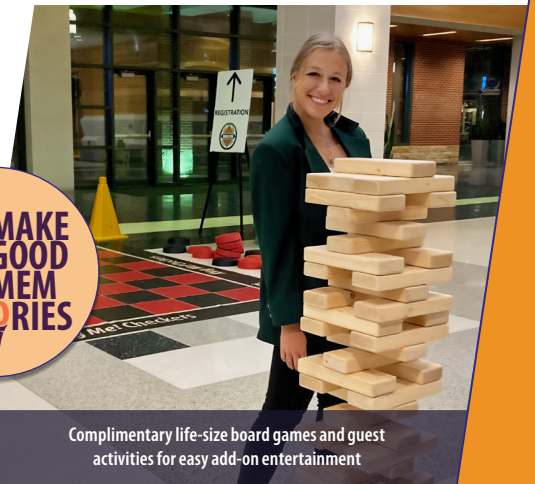
Complimentary life-size board games and guest activities for easy add-on entertainment