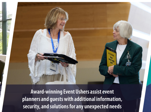
Award-winning Event Ushers assist event planners and guests with additional information, security, and solutions for any unexpected needs