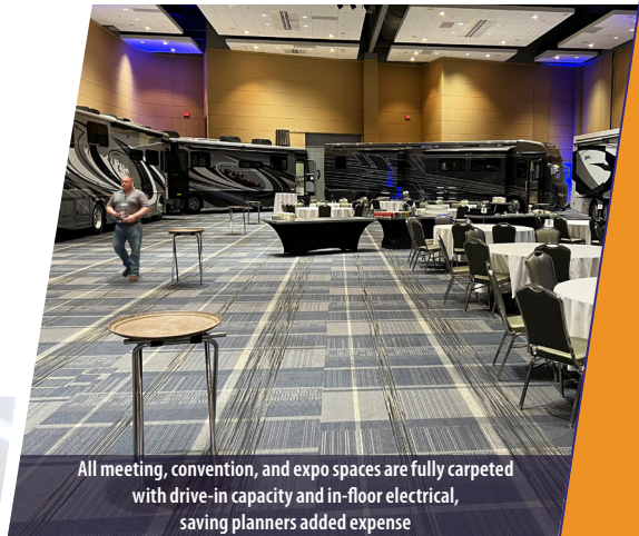
All meeting, convention, and expo spaces are fully carpeted with drive-in capacity and in-floor electrical, saving planners added expense